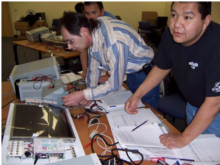
Previous class at Sycuan, San Diego.