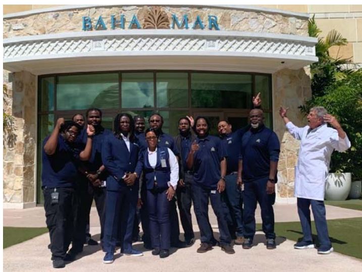
Previous class at Baha Mar, The Bahamas

All this doesn't amount to a hill of beans if you can't remove and replace the components without butchering the printed circuit board. That's why we have two, hands-on soldering labs. If you cannot solder properly, you are useless as an electronic technician. Worse than useless, you can cause hundreds or thousands of dollars worth of damage and/or lost revenue if you're not careful.