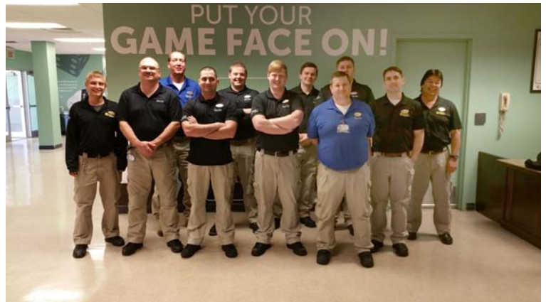
New York @ Turning Stone Resort