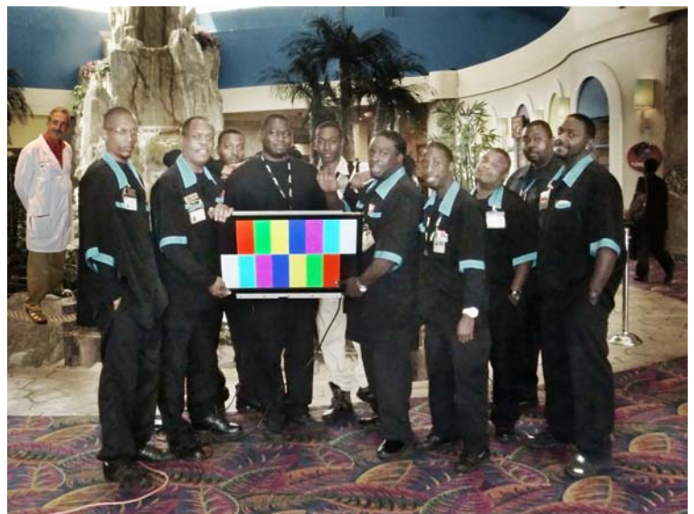
Isle of Capri, Lula Mississippi