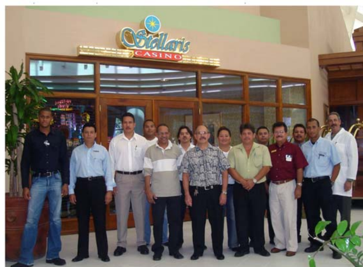
Previous classes at Aruba Stellaris Casino