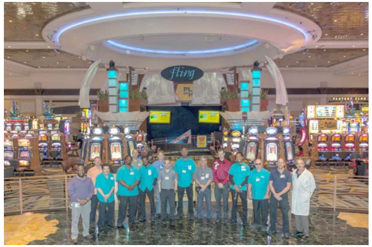
Pompano Park, Florida