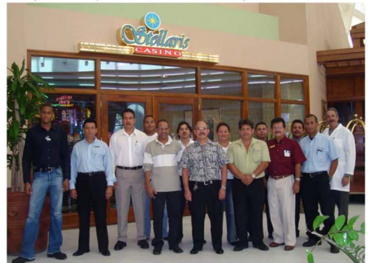
Previous classes at Aruba Stellaris Casino