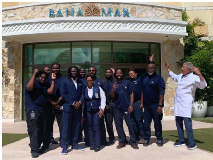
Previous class at Baha Mar, The Bahamas

There is no single trick to repair but it's not usually too difficult once you learn a few basics. During the class we will really stress component identification and testing so you'll learn how to find most bad parts (resistors, capacitors, transistors, etc.) yourself. This is an important part of the class. You absolutely must know what the parts are and how to test them to see if they are good or bad. Each student will receive his/her own digital multimeter (for testing components and making measurements) as part of their classroom materials package.